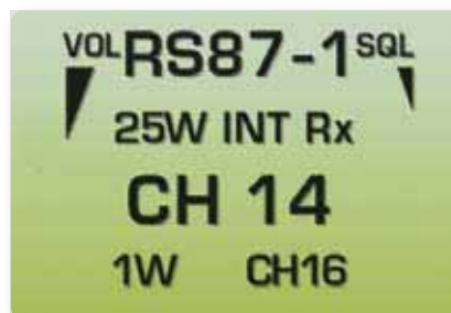
A single press of the MENU key gives access to all VHF functions.