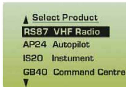
Drop down list.