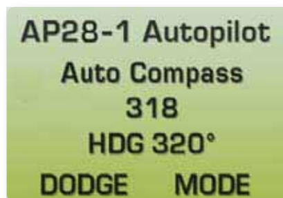
Select advanced steering functions from the menu.