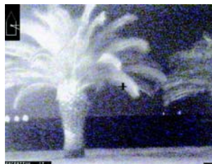
Ultra Low Light Camera