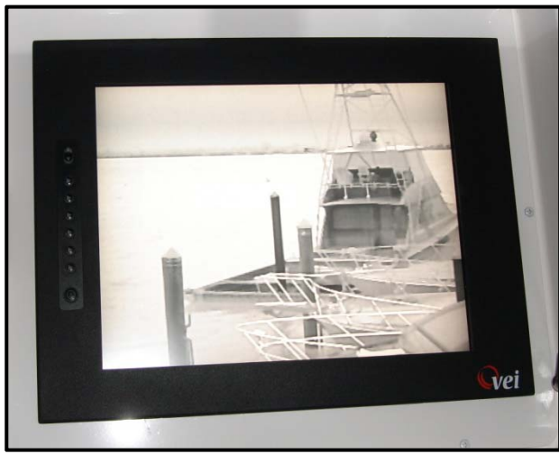
Triton Imager as displayed on optional VEI Monitor