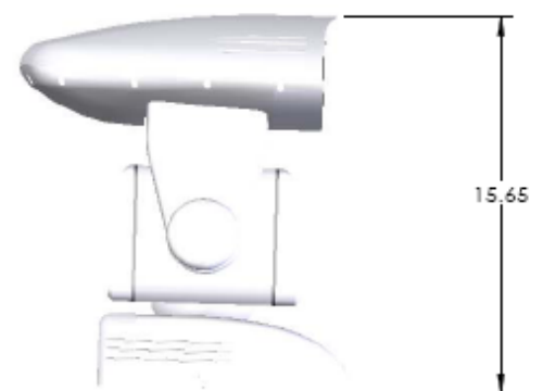
Dimensions in Inches