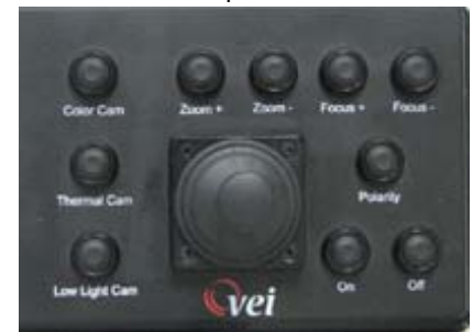
Outdoor Waterproof Controller