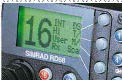
Dot matrix. Large, clear back lit LCD and soft keys for intuitive operation.