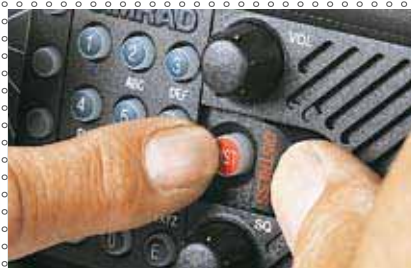
The distress key is protected from accidental operation by a spring loaded cover.