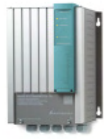
Mass Systems switch