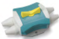
MasterDC Switch 500