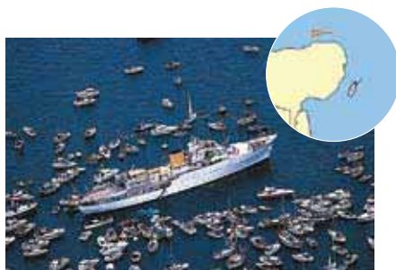
Identification with blocked view

With radar antennas mounted high above sea level, smaller vessels can remain undetected below the beam, mistaken as waves or lost in vessel blind spots.