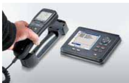
Select a MMSI number from your favourites list and send a DSC call.