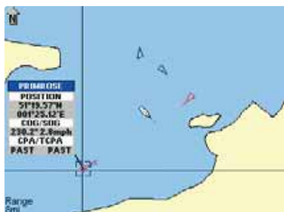
Move the cursor over a target to identify the vessel.