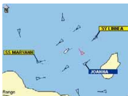
Be alerted when your friends are in the same area.