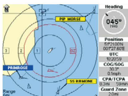
Range rings with distance to any targets or shore, just like a radar.