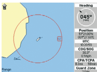
A guard zone with alarm.