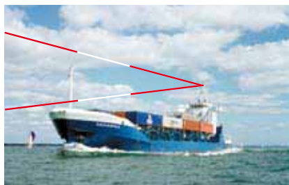
Blind spots and large waves

With radar antennas mounted high above sea level, smaller vessels can remain undetected below the beam, mistaken as waves or lost in vessel blind spots.