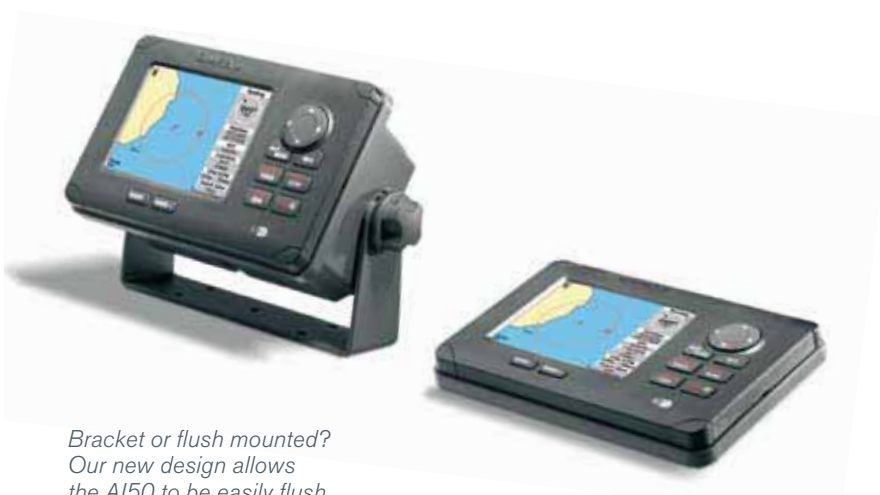
Bracket or flush mounted? Our new design allows the AI50 to be easily flush mounted, standing or hanging from the supplied bracket.

You can now send the DSC call from the radio. No longer do you need to have a listing of vessel information with you. Think of it as a graphical and dynamic phone directory.